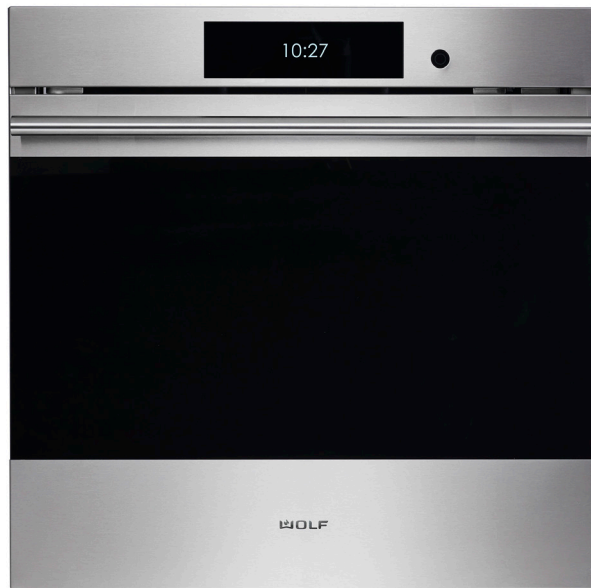
60 CM E SERIES TRANSITIONAL SINGLE OVEN

Even the most compact kitchen can experience consistently delicious results.