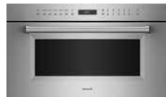
M Series Professional

MODEL OPTIONS SPO30TE/S/TH W 29⅞" H 17⅞" D 21½"