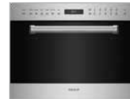
E Series Professional

MODEL OPTIONS SPO24TE/S/TH W 23½" H 17⅞" D 21½"