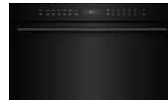
E Series Contemporary

MODEL OPTIONS SPO30CM/B/TH W 29⅞" H 17⅞" D 21½"