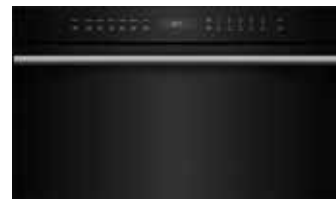
M Series Contemporary

MODEL OPTIONS SPO30CM/B/TH W 29⅞" H 17⅞" D 21½"