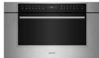
M Series Transitional

MODEL OPTIONS SPO30CM/B/TH -Shown with optional Black Handle Accessory W 29⅞" H 17⅞" D 21½"