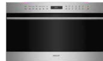
E Series Transitional

MODEL OPTIONS SPO30TM/S/TH W 29⅞" H 17⅞" D 21½"