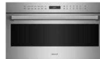
E Series Professional

MODEL OPTIONS SPO30PM/S/PH W 29⅞" H 17⅞" D 21½"