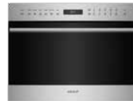
E Series Transitional

MODEL OPTIONS SPO24TE/S/TH W 23½" H 17⅞" D 21½"