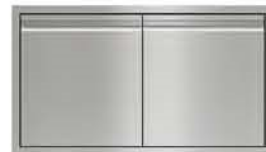
Short Dry Storage

61 CM -Available in left or right hinge W 610 mm H 864 mm D 572 mm