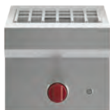
Built-in Burner Module ICBBM13 W 330 mm H 273 mm D 762 mm