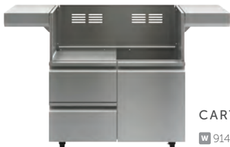
CART36 W 914 mm H 927 mm D 705 mm