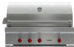
107 CM ICBOG42 -Built-in or Freestanding W 1067 mm H 686 mm D 762 mm 2 burners, rotisserie and sear zone Cooking Surface 483 mm x 965 mm