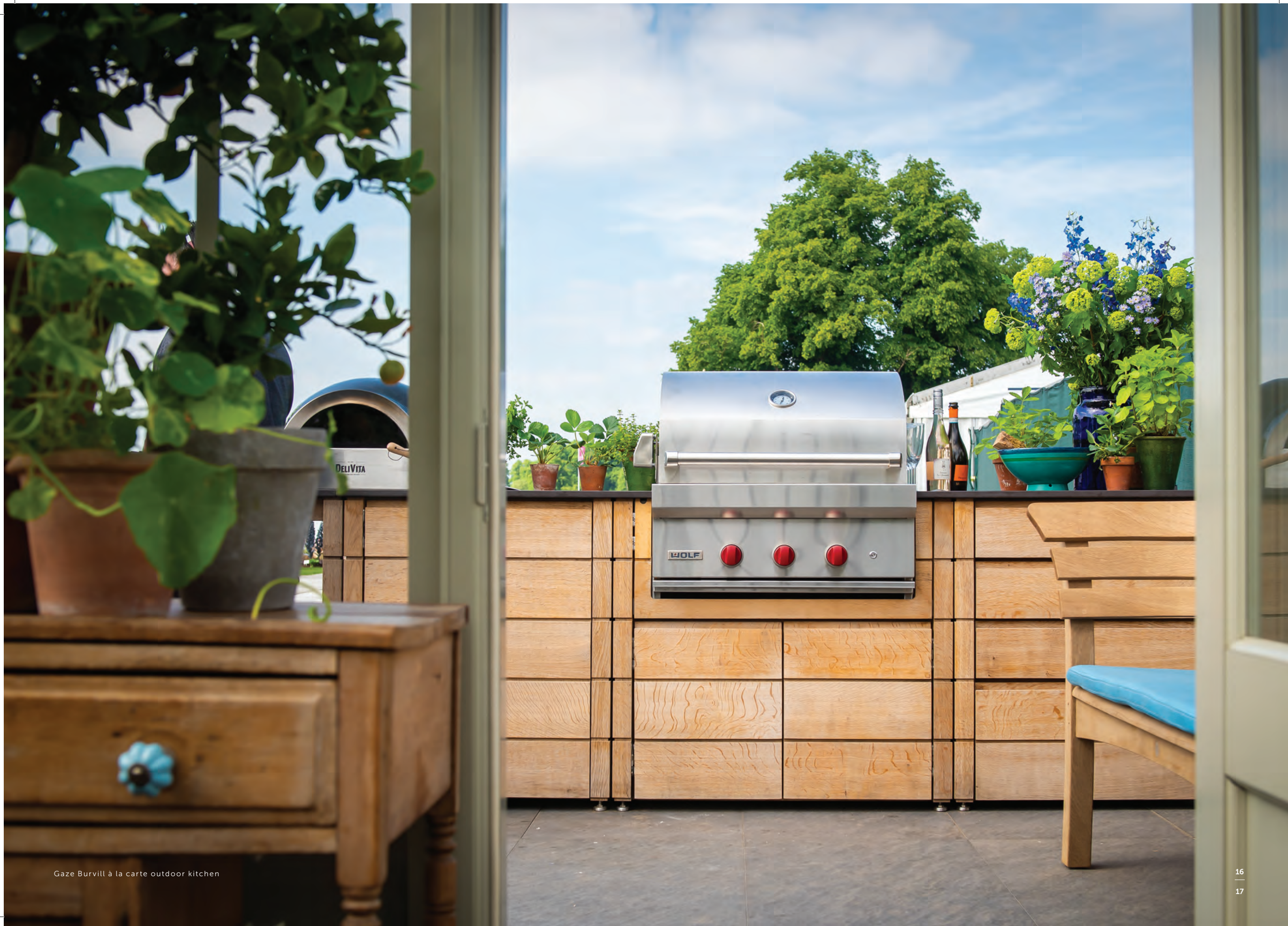
Gaze Burvill à la carte outdoor kitchen