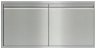
Double Door 107 CM W 1067 mm H 527 mm