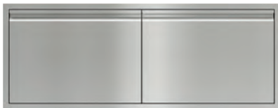
Double Door 137 CM W 1372 mm H 527 mm