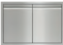
Double Door 76 CM W 762 mm H 527 mm