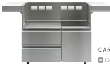
CART42 W 1067 mm H 927 mm D 705 mm