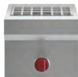
Side Burner ICBSB13 W 330 mm H 273 mm D 762 mm