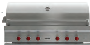
137 CM ICBOG54 -Built-in W 1372 mm H 686 mm D 762 mm 3 burners, 2 rotisserie and sear zone Cooking Surface 483 mm x 1270 mm