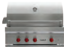
91 CM ICBOG36 -Built-in or Freestanding W 914 mm H 686 mm D 762 mm 2 burners, rotisserie and sear zone Cooking Surface 483 mm x 813 mm