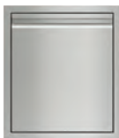
Single Door 48 CM -Available in left or right hinge W 457 mm H 527 mm