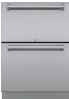
ICBID-24RO W 610 mm H 876 mm D 610 mm