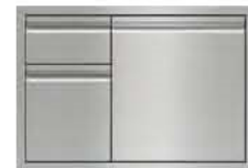
Combination Double Drawer and Door Storage