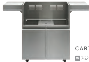
CART30 W 762 mm H 927 mm D 705 mm