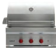
76 CM ICBOG30 -Built-in or Freestanding W 762 mm H 686 mm D 762 mm 2 burners and rotisserie Cooking Surface 483 mm x 660 mm